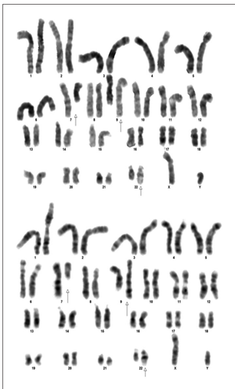
Figure 1: Two photographic karyograms showing Variant Ph translocation t(7;9;22) in a patient with Chronic Myeloid Leukemia

100 interphase + metaphase were analyzed all cells (100%) showed evidence of bcr/abl fusion signal pattern (Figure 2).